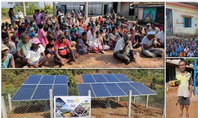
Rotary Club of Bombay Completes Landmark 40th Integrated Village Development Project Over 13,000 Lives Transformed

February 12, 2025 ( https://rajasthanexpress.in/index.php/2025/02/ )